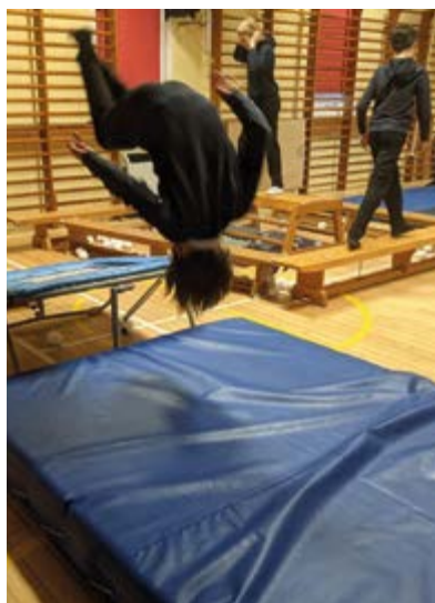
Junior Leadership P6 & P7 – training to understand the elements needed to run a safe and fun session for younger children.