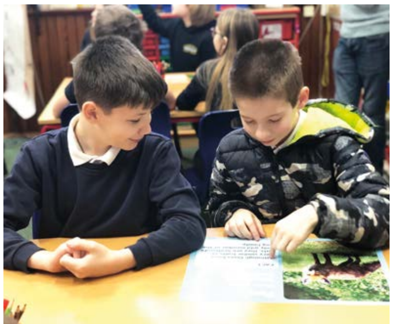
Bonar Bridge Primary school had a visit from a SSPCA representative.