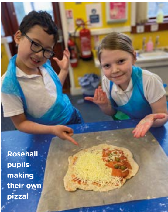
Rosehall pupils making their own pizza!