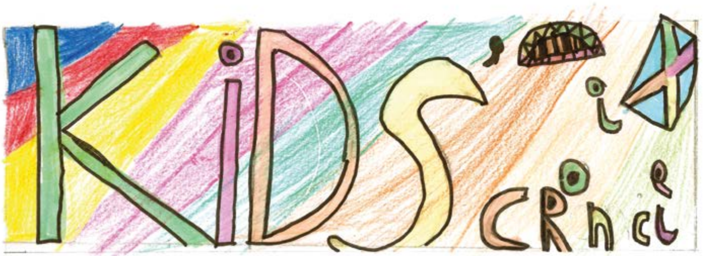
Quarterly magazine curated by and for the Kyle of Sutherland children