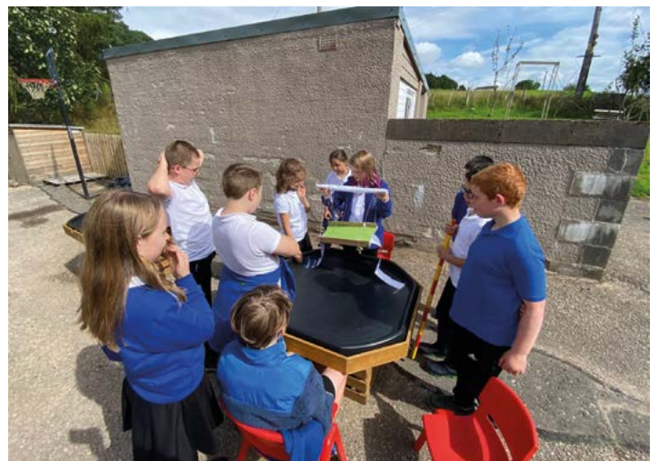
STEM challenge: Billy Goats Bridge