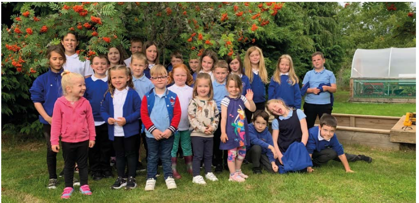
Gledfield Primary pupils gathered under the rowan tree for a photo at the beginning of the term.

Quarterly magazine curated by and for the Kyle of Sutherland children