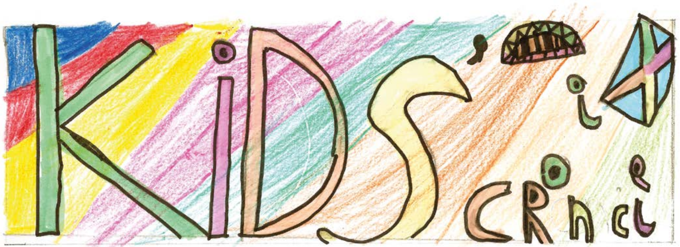
Quarterly magazine curated by and for the Kyle of Sutherland children