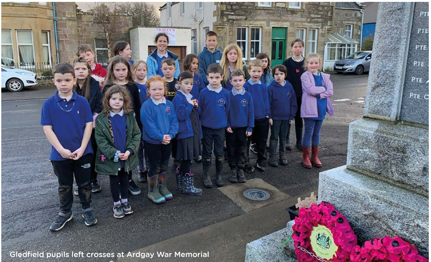
Gledfield pupils left crosses at Ardgay War Memorial