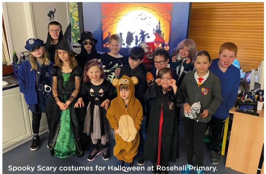
Spooky Scary costumes for Halloween at Rosehall Primary.

Halloween, Remembrance Sunday and Children in Need were some of the events in which children from our local primary schools participated.