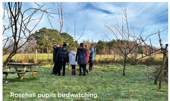
Rosehall pupils birdwatching.