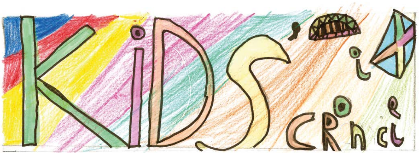
Quarterly magazine curated by and for the Kyle of Sutherland children