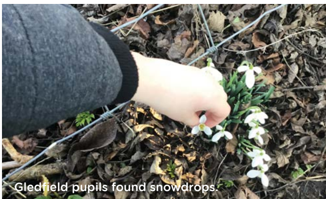
Gledfield pupils found snowdrops.