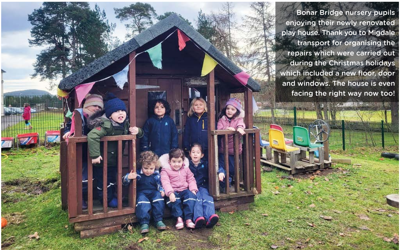
Bonar Bridge nursery pupils enjoying their newly renovated play house. Thank you to Migdale transport for organising the repairs which were carried out during the Christmas holidays which included a new floor, door and windows. The house is even facing the right way now too!