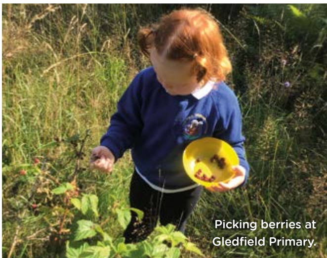
Picking berries at Gledfield Primary.

Pupils are busy meeting friends and making new ones. Local schools offered them many activities to enjoy the spell of mild weather at the beginning of the term.