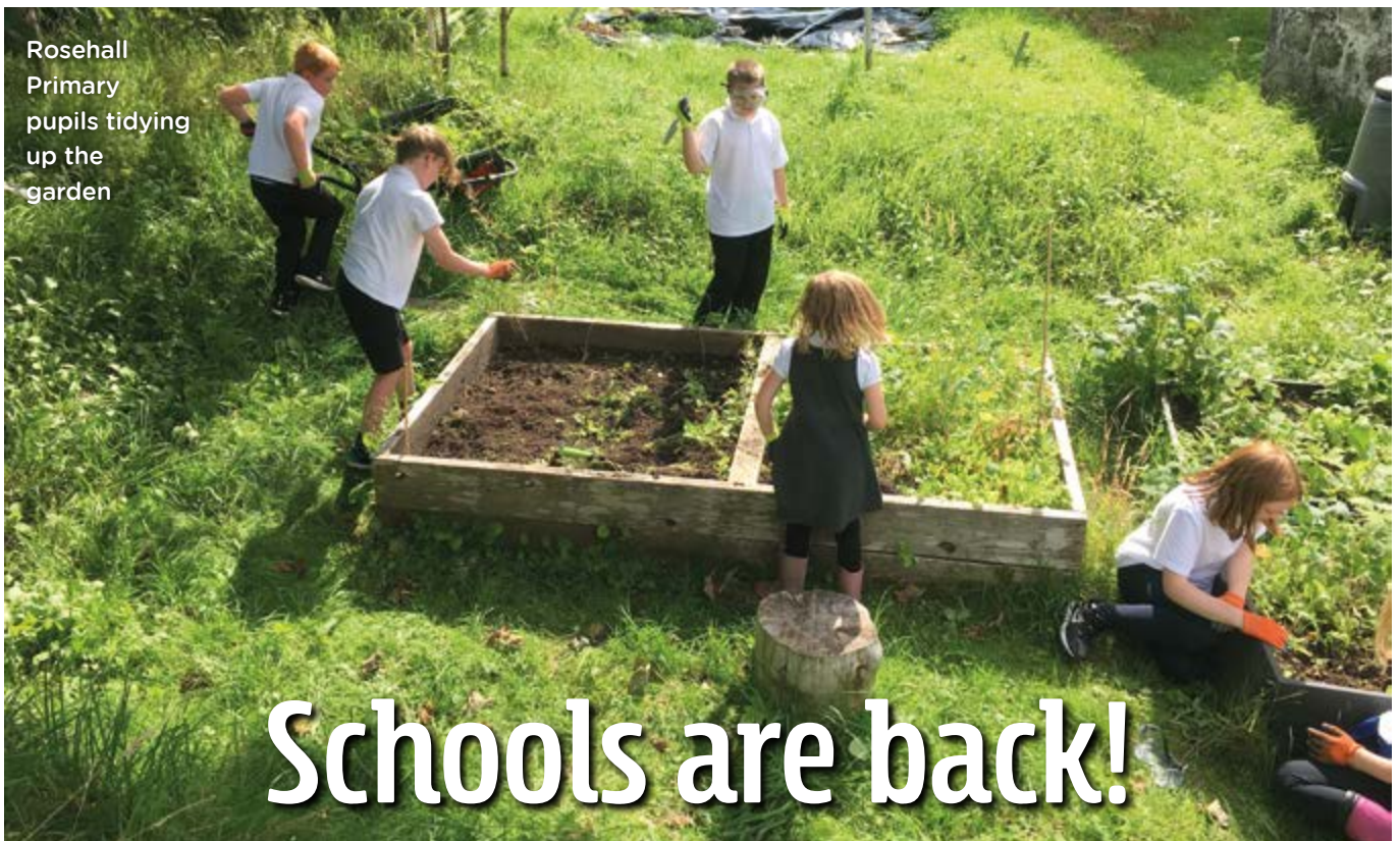
Rosehall Primary pupils tidying up the garden