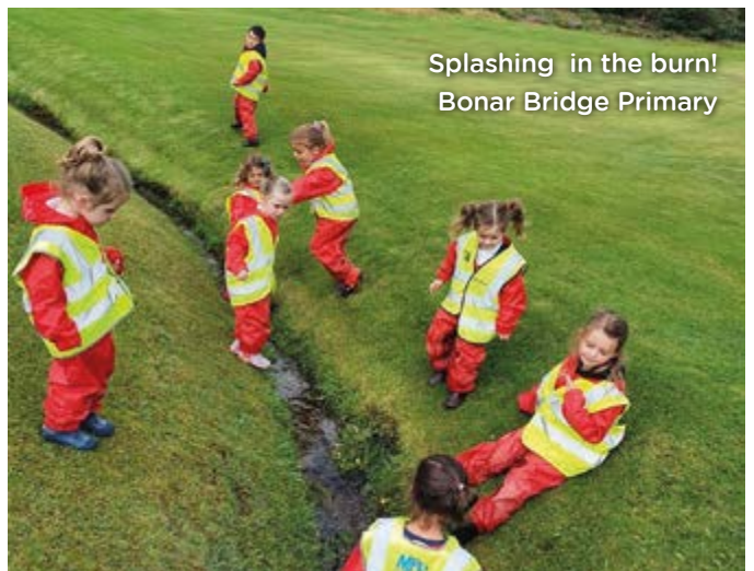
Splashing in the burn! Bonar Bridge Primary