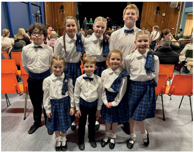
Winners! Rosehall PS took home joint Overall winner's trophy and the Small School winner's trophy