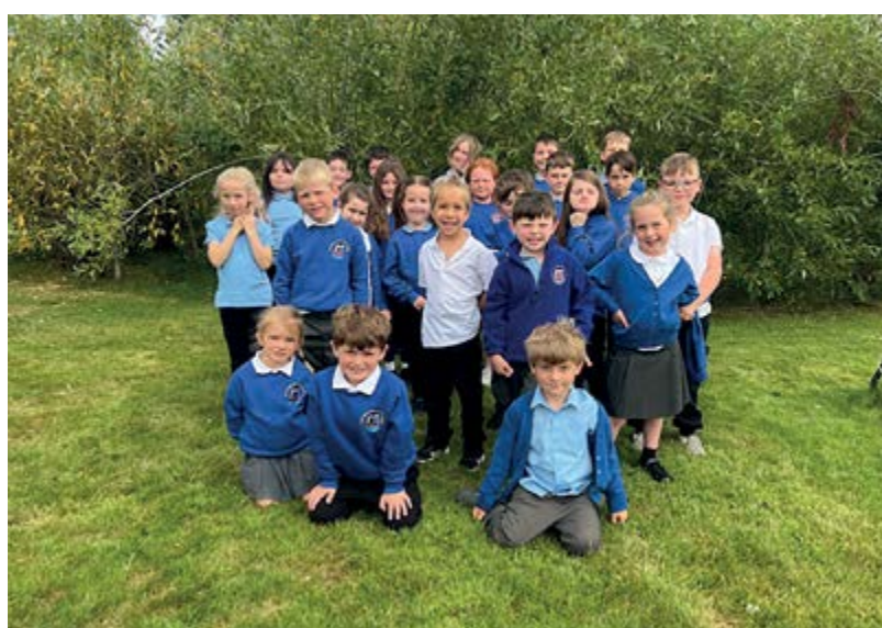
Gledfield Primary School group photo.

Bonar Bridge Nursery Class enjoying a very sociable snack together. Our new starts bring the nursery class up to 12 pupils and each have settled into the nursery environment really well.