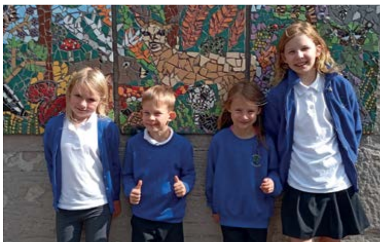
Rosehall Primary School P2-P6 class.

We have welcomed three new Primary 1 starts at Bonar Bridge Primary School in August.